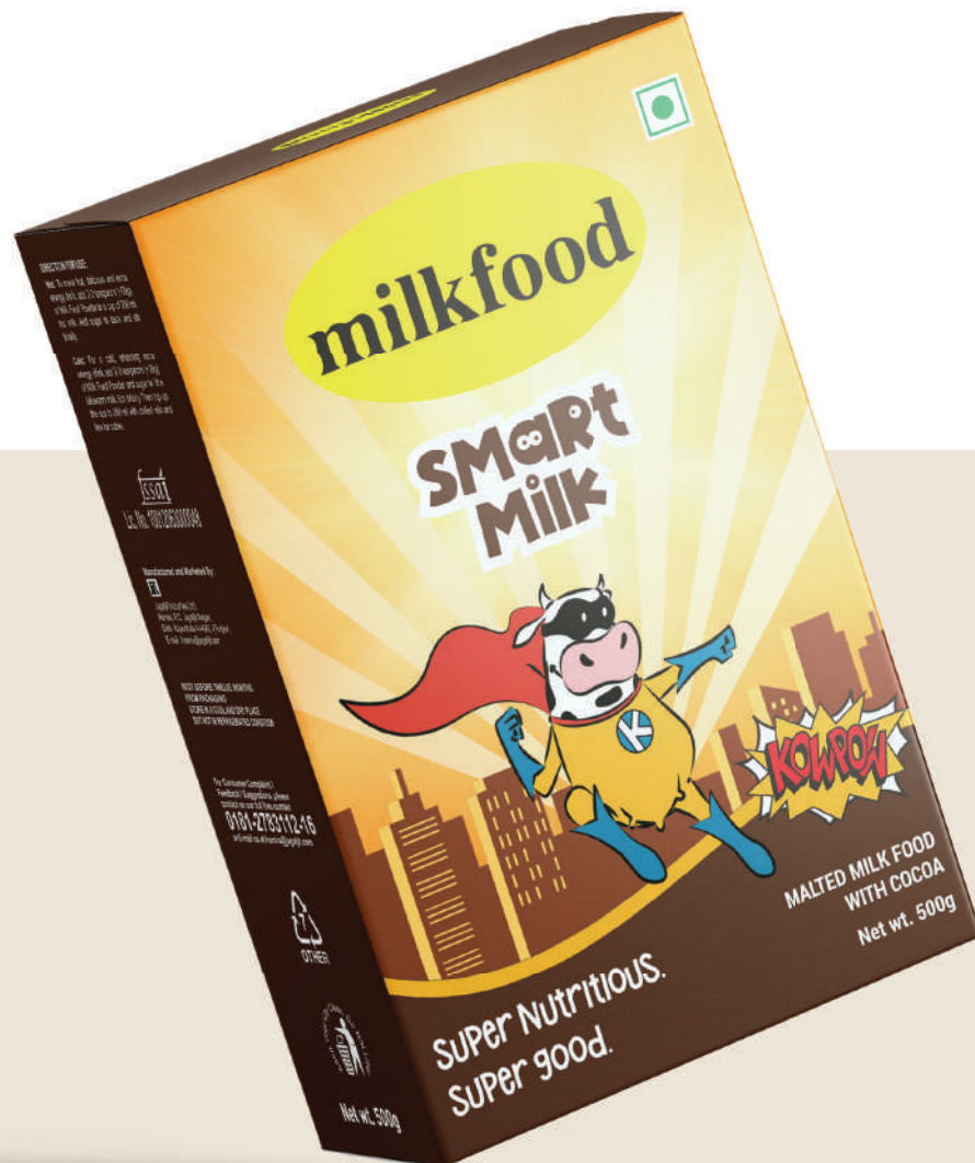
MALTED MILK FOOD